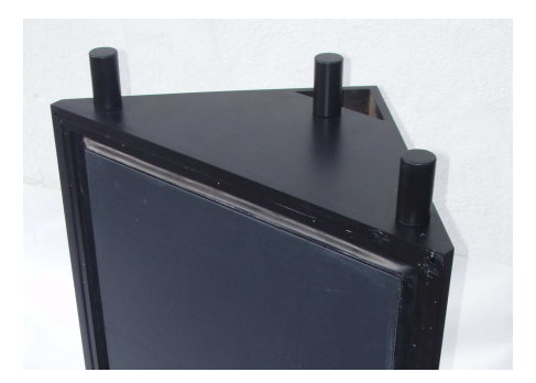
Fig 3: SpringTrap<sup>™</sup> bottom revealing the primary port

<u>www.msr-inc.com</u> Fax: (415) 883-8147